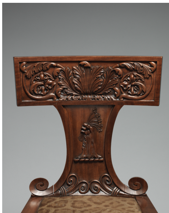
A close-up of the carving on one of the chairs from the set in the Metropolitan Museum