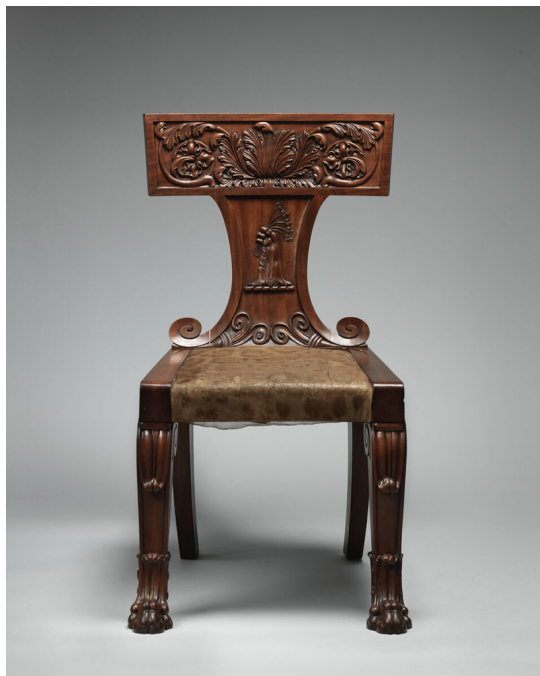
One from the set of chairs in the Met Museum